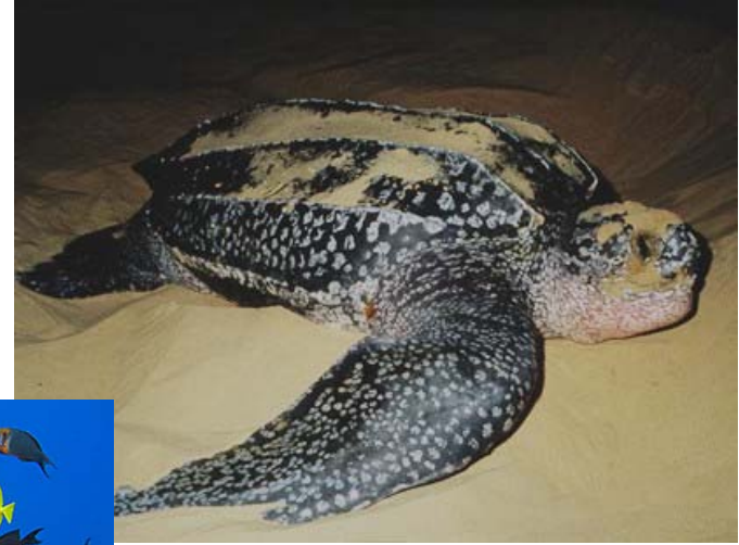
Leather back turtle